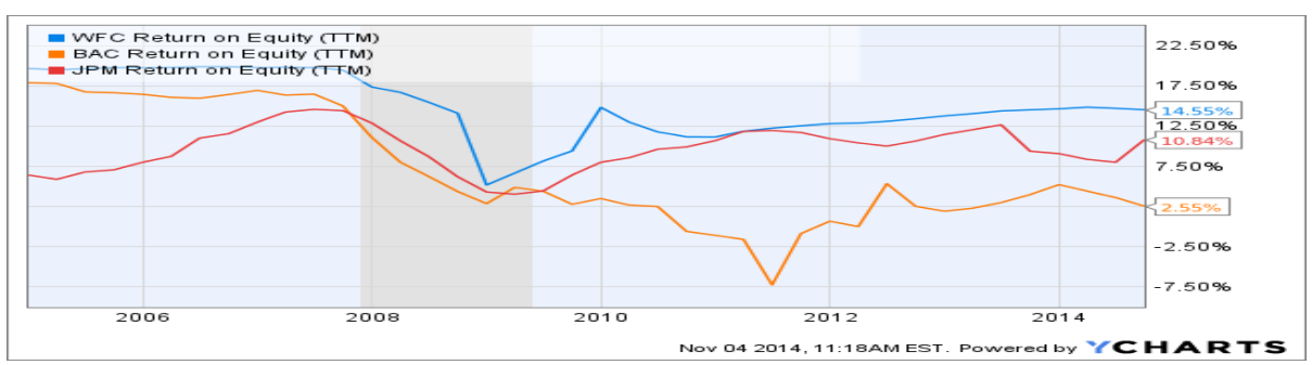
Figure 1: ROE since 2008 crisis

There are two primary causes for this reduced ROE from pre-crisis levels. First, the Federal Reserve Bank (the Fed) has stimulated the overall US economy through both traditional measures to bring the Fed funds rate near zero, and non-traditional monetary policy such as Quantitative Easing (QE) to bring longer-term rates lower resulting in an extremely flat yield curve. This reduces the amount of profit banks can achieve by "borrowing short and lending long" and creates interest rate risk, which will be discussed in more detail later in this paper. The senior economist of one of the largest banks in the US estimates that the prolonged low interest rate environment accounts for approximately two thirds of the reduction in ROE performance. <sup>14</sup> The remaining reduction in ROE is due to the higher cost of compliance levied on firms since the passage of Dodd-Frank. Those costs are significant for big firms, but even harder on smaller banks, which cannot afford the overhead and still remain profitable; this once again contributes to increasing market concentration and large firms growing relatively larger. In addition, some banks have suffered from huge fines in the past two years for misconduct leading to the financial crisis, further constraining ROE. Data on regulatory fines is provided in Figure 2, Appendix B. <sup>15</sup>