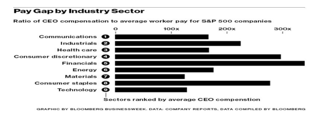
Figure 5: Executive Pay by Sector<sup>102</sup>