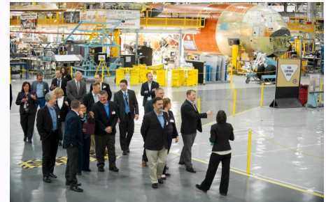
The Industry Studies program allows an experiential learning opportunity by providing students the opportunity to interact with senior leaders in government and private industry.