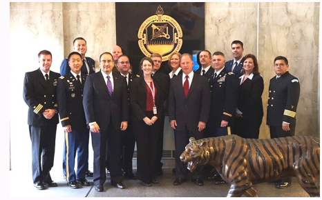
Classes consist of small seminars of students with diverse backgrounds; government and industry, military and civilian, international and domestic.

Track 2: Students complete the entire program during a two-year period while attending in a part-time status. A customized program of study will be developed to define course requirements for each of the two years. A Masters degree will be awarded once all requirements have been completed at the end of the two years.